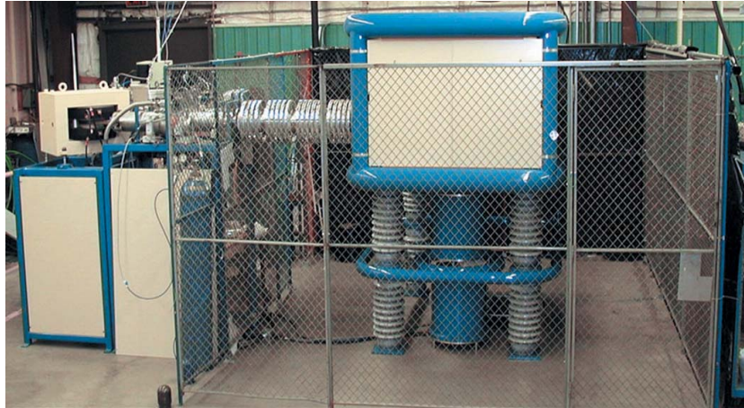
Figure 1: Prototype Single Stage AMS system with the acceleration tube exiting the 300 kV deck to the left, followed by the gas stripper and 90° energy analysis magnet.

A prototype system was built and tested over a one year period. A 300 kV deck was constructed (Figure 1) with a standard 40 sample multi cathode source of negative ions by cesium sputtering (40 MC-SNICS) followed by a 90° mass analysis magnet. Injection energy is about 40 kV.