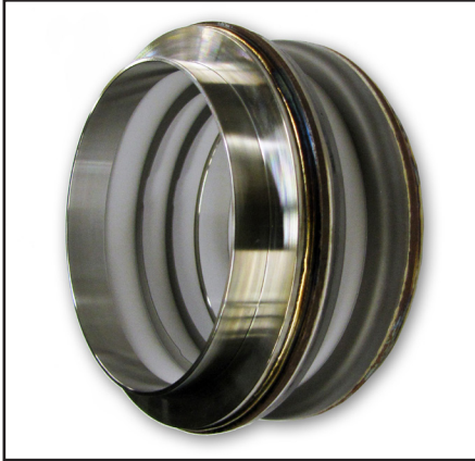
Single gap 4" beamline insulator with weldable tube ends