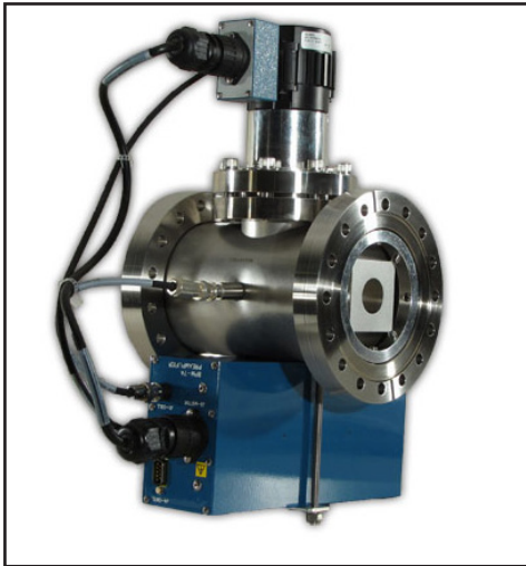
The original NEC beam profile monitor, Model BPM80, which monitors beams up to 25mm diameter.

The unique design of the NEC beam profile monitors (BPM) have made them among the most popular and reliable beam diagnostic instruments available. The NEC BPM reliably gives accurate information concerning the ion beam cross-section for ion beams with currents as low as 1nA.