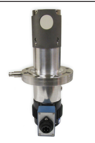
BPM81- 1.0" dia. aperture

The NEC BPM81 is designed for insertion into a customer supplied housing. It is designed to monitor beams up to 1.0" (2.5cm) diameter. The BPM81 is ideal for use when beamline length is at a premium.