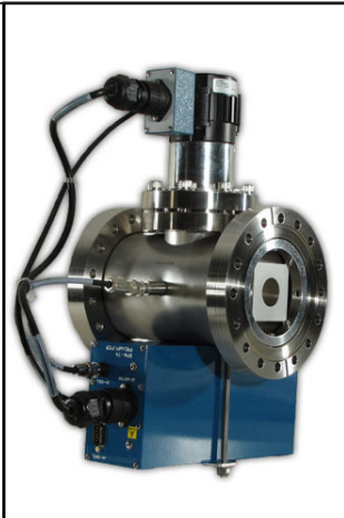
BPM80- 1.0" dia. aperture

The NEC BPM80 is our original BPM and our most popular configuration. It is designed to monitor beams up to 1.0" (2.54cm) diameter. The BPM80 is in use worldwide on electrostatic, cyclotron, and linear accelerator systems.