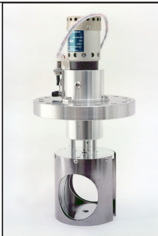
BPM82- 2.0" dia. aperture

The NEC BPM82 is a large aperture unit designed for insertion into a customer-supplied housing. It is designed to monitor beams up to 2.0" (5cm) diameter. The BPM82 is ideal for applications involving large diameter beams when beamline length is at a premium.