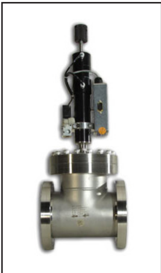
Model FC50 in a standard 4" dia. housing with 6" OD flanges.

Standard housings are available, dependent on model. They can also be inserted into customer supplied housings, again dependent on model. Standard flanges include ConFlat, Dependex, and NEC; however custom flanges are available upon request.