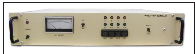
Multi-Unit Faraday Cup controller for local control. Controls up to four (4) Faraday Cups.

When using the local controller, a picoammeter is needed for current readout. It provides a 0-2V signal for use with the analog meter on the front of the controller. NEC can provide one or suggest a suitable model upon request.