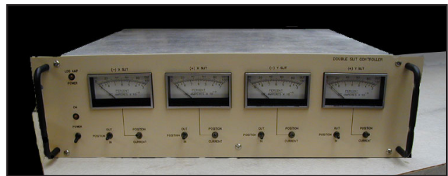
The local slit controller has switchable analog meters which display the slit position and current read.

For a complete motorized slit system, a slit, controller, and logarithmic amplifiers (one per element pair) are needed. NEC offers a complete line of dual channel log amps for use with the controllers and current monitors.