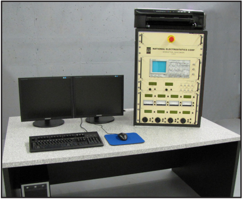
Control desk with equippment rack

The control console consists of a desk with an equipment rack. It contains the computer, four (4) assignable knobs, four (4) assignable meters, and an oscilloscope for displaying signals.