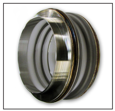
Single gap 4" beamline insulator with weldable tube ends