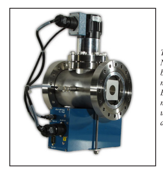
The original NEC beam profile monitor, Model BPM80, which monitors beams up to 25mm diameter.

The unique design of the NEC beam profile monitors (BPM) have made them among the most popular and reliable beam diagnostic instruments available. The NEC BPM reliably gives accurate information concerning the ion beam cross-section for ion beams with currents as low as 1nA.