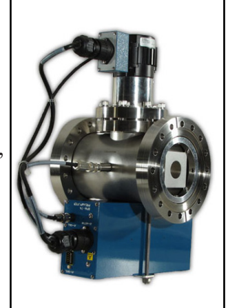
BPM80- 1.0" dia. aperture

The NEC BPM80 is our original BPM and our most popular configuration. It is designed to monitor beams up to 1.0" (2.54cm) diameter. The BPM80 is in use worldwide on electrostatic, cyclotron, and linear accelerator systems.