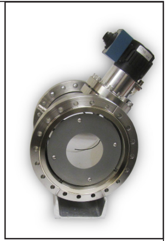
BPM83- 2.75" dia. aperture

The NEC BPM83 is specifically designed to handle large diameter ion beams up to 2.75" (6.98cm) in diameter. The BPM83 is ideal for applications involving large diameter beams, such as those commonly found in production ion implanters.