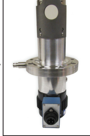
BPM81- 1.0" dia. aperture

The NEC BPM81 is designed for insertion into a customer supplied housing. It is designed to monitor beams up to 1.0" (2.5cm) diameter. The BPM81 is ideal for use when beamline length is at a premium.