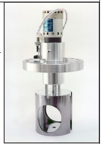
BPM82- 2.0" dia. aperture

The NEC BPM82 is a large aperture unit designed for insertion into a customer-supplied housing. It is designed to monitor beams up to 2.0" (5cm) diameter. The BPM82 is ideal for applications involving large diameter beams when beamline length is at a premium.