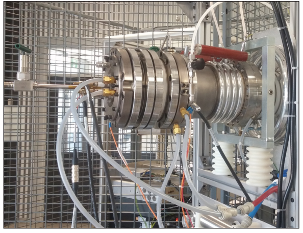
Liquid Cooled Negative Duoplasmatron Source

A plasma discharge is maintained in the source which provides the supply of ions. It is a hot cathode type source where a hot filament emits electrons which sustain the plasma by making ionizing collisions with the gas molecules. The plasma at the Zwischen tip is focused by a magnet located inside the source. Gas is let into the source through the anode flange.