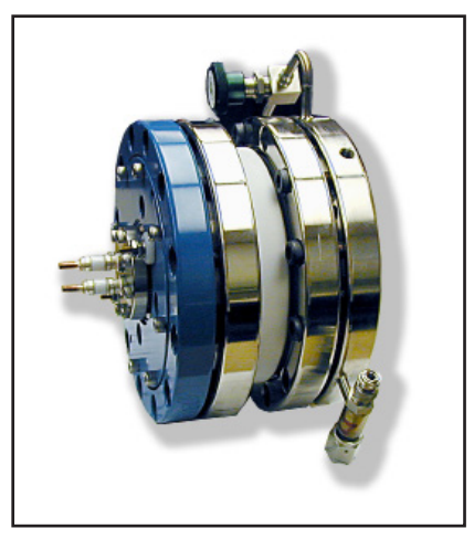
Positive Ion Duoplasmatron Ion Source

Beams of He<sup>+</sup>, O<sup>+</sup> and Ar<sup>+</sup> are routinely produced with currents on the order of 2 to 2.5 mA when arc and extractor voltages of about 100 V and 30 kV DC respectively are used. Beams of H<sup>+</sup> up to 10 mA can be expected.