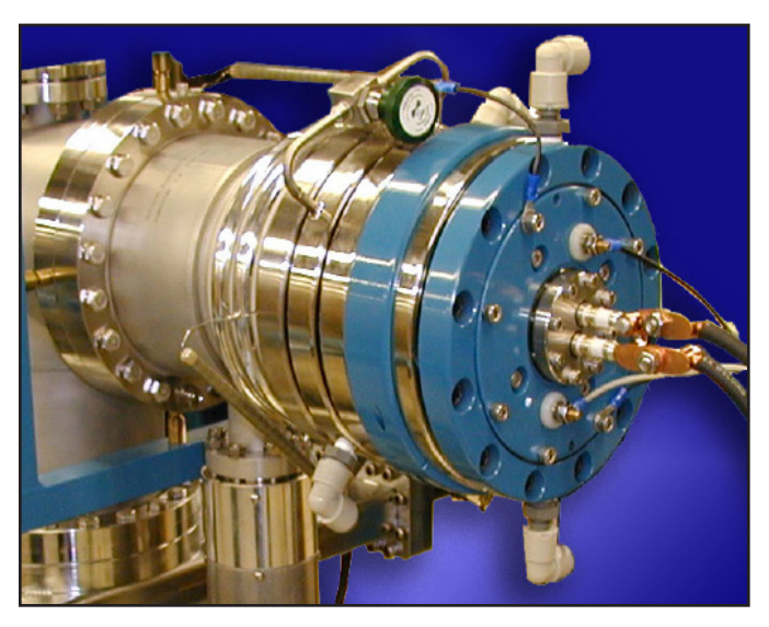
Positive Ion Duoplasmatron Ion Source with extractor assembly.