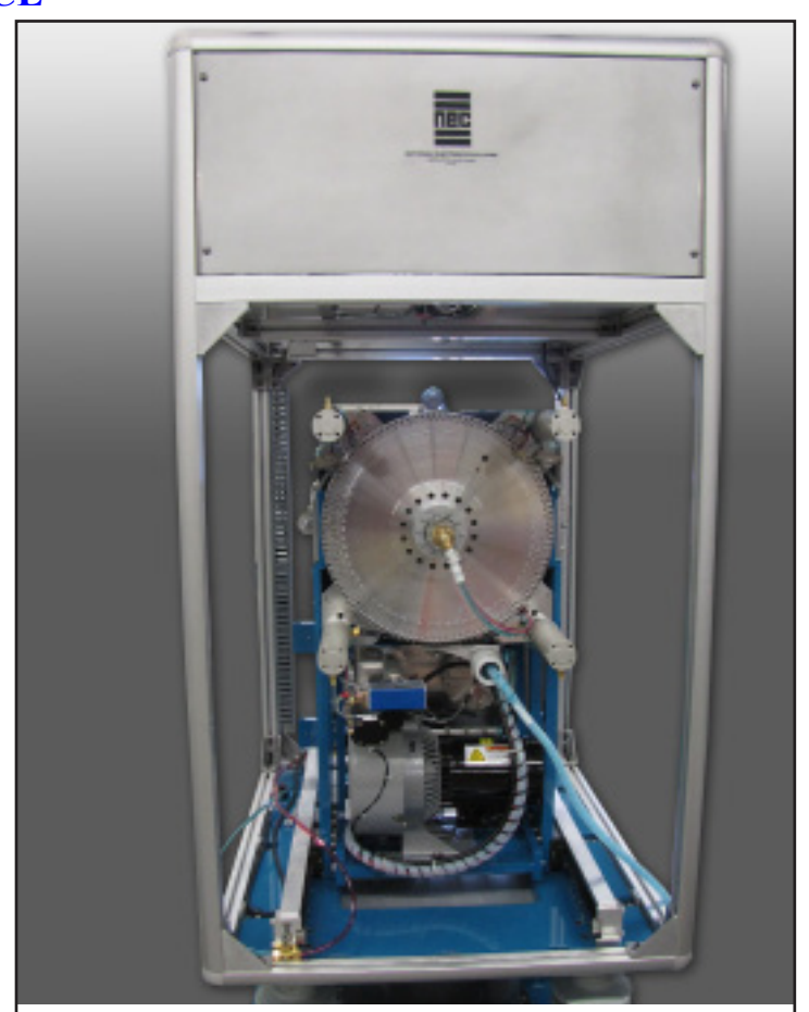
The NEC 134 sample Multi-Cathode Source of Negative Ions by Cesium Sputtering (MC-SNICS) is designed for high throughput applications where a large number of AMS samples is expected in a short period of time. The 134 MC-SNICS is equipped with bi-directional cathode indexing for rapid location of any cathode in any of the 134 positions. The simple cathode indexing system has proven to be highly reliable and is fully computer controlled to allow the analysis of groups of AMS samples in any order.

System start up and ion beam tuning is made easy by assignable knobs and analog meters. The software is equipped with flat topping routines, energy and mass determination through the bending magnets, software strip chart recorders, and storage of all AMS parameters for every <sup>14</sup>C event.