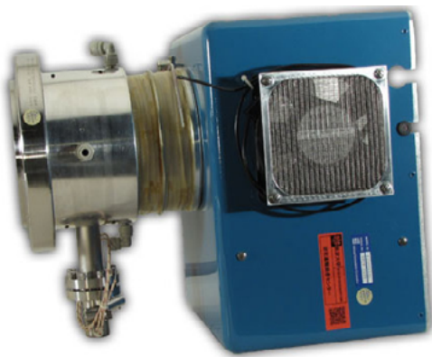
The Alphatross source is a compact, reliable source of light negative ions. A positive RF source injects immediately into a compact rubidium charge exchange cell.

\text{H}^- is primarily used for Particle-induced X-ray Emission (PIXE) and Nuclear Reaction Analysis (NRA) applications, while \text{He}^- is primarily used for Rutherford Backscattering (RBS). \text{NH}^- produces an \text{N}^+ beam, which is primarily used in NRA to profile H with ^{15}\text{N} .