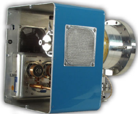
The Alphatross source and oscillator are housed in an RF shielded box. The RF plasma bottle is easily demounted for rapid servicing.