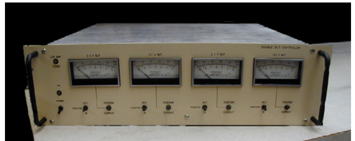
The local slit controller has switchable analog meters which display the slit position and current read.

Please contact NEC for information regarding control of the BDS18.